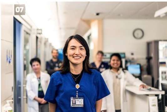
Nursing team members at the Bezos Family Immunotherapy Clinic at SCCA.

How can art help celebrate the essential role nurses play in the delivery of excellent, compassionate patient care? At Seattle Cancer Care Alliance (SCCA), they provide a sense of celebration in a very special way, in the form of an artist-commissioned wall, unveiled on July 30 at SCCA's main clinic. The wall features the names of more than 30 SCCA nurses who have ever received a Daisy Award . Members of the patient family who started the award, as well as the artist, are available for interview.