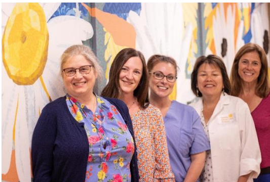
Proud recent Daisy Award recipients pose in front of the newly dedicated wall at SCCA.

Interested in learning more about any of these updates? Click here to contact us!